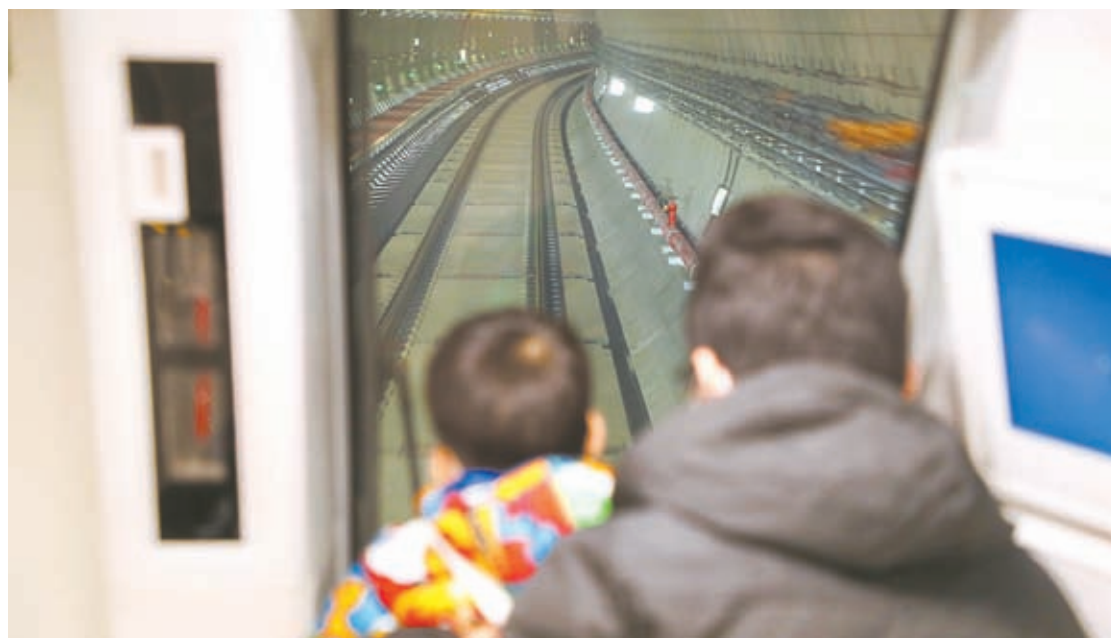
Passengers on Line 15 enjoy a view of the tunnel ahead. Line 15, which opened in 2021, is not the first Metro line to operate without a driver. Currently, Shanghai has five driverless lines, namely Line 10, 14, 15, 18 and Pujiang.