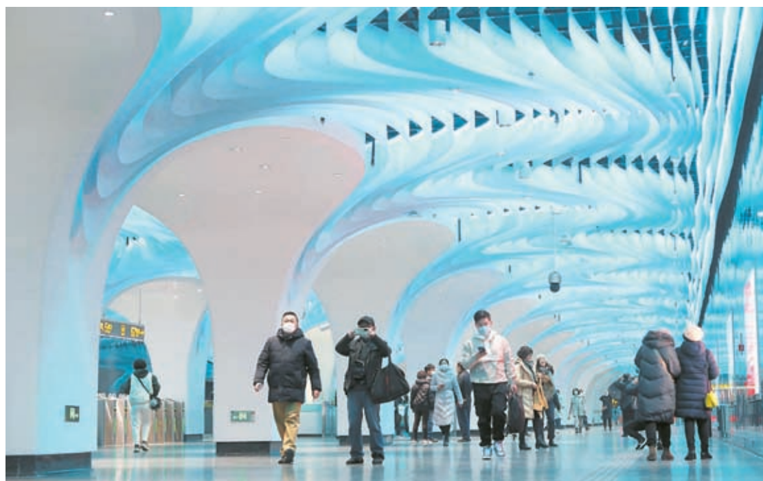
The Yuyuan Station on Line 14, which started operation on December 30, 2021.