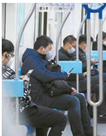
The reading habits of Metro commuters have changed in the past 30 years — 2007 (left) 2020 (right).