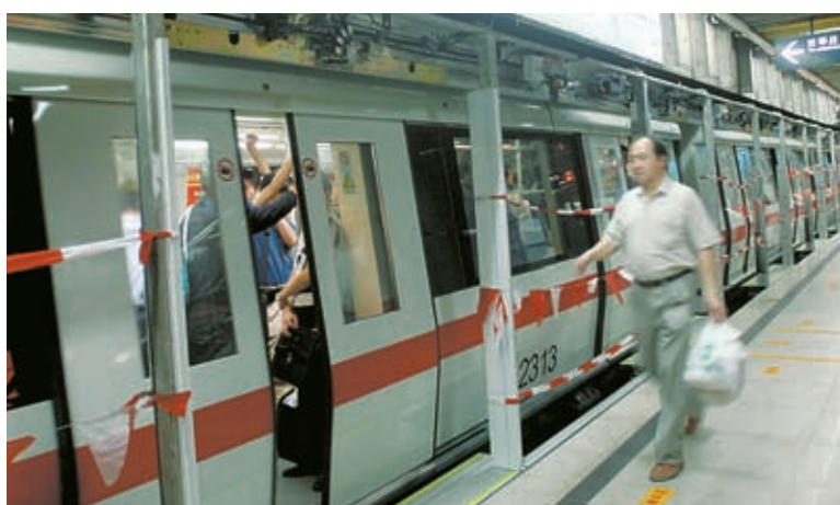
Screen doors were installed in all 12 underground stations of Line 1 in 2006. The picture shows Hanzhong Road Station under construction. — Dong Jun