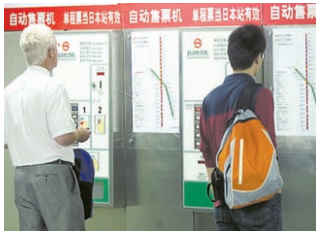
Commuters buy tickets at the People's Square Station on May 30, 2005. There were two Metro lines at that time.