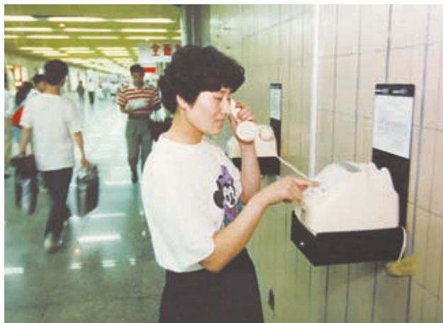
A young woman uses a coin-box telephone in a Metro station on Line 1 in 1995.