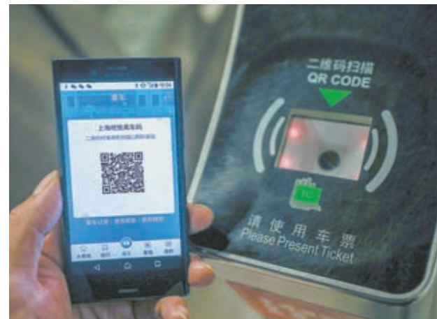
On January 20, 2018, the Metro began testing QR code entry.